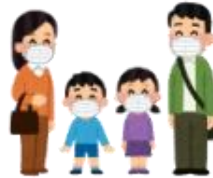
Put a mask on