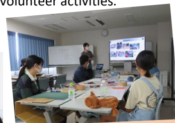
A graduate student came to talk about his experience