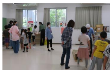
Shooting game and Bowling was popular among children