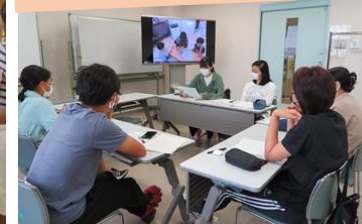
Students talked about this volunteer event and about their future dreams on the last day.