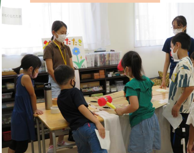
Excited with "Whack the Mole Game"