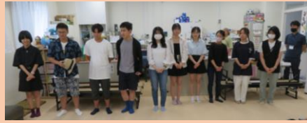
Volunteers introducing themselves