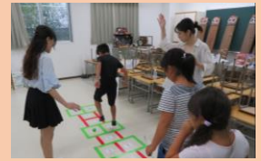
Children playing at the event (2 pic. from 2023)