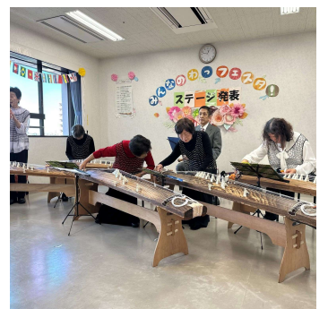
Last year's Minna no "Wa!" Festa