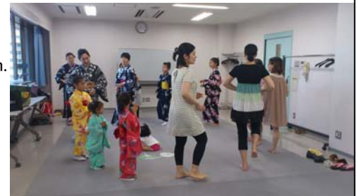
Photograph: 1 st meeting/ Dance

TEL: 232-9544 (Foreign Languages available)