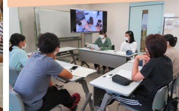
Students talked about this volunteer event and about their future dreams on the last day.