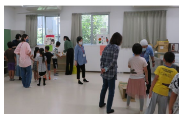
Shooting game and Bowling was popular among children