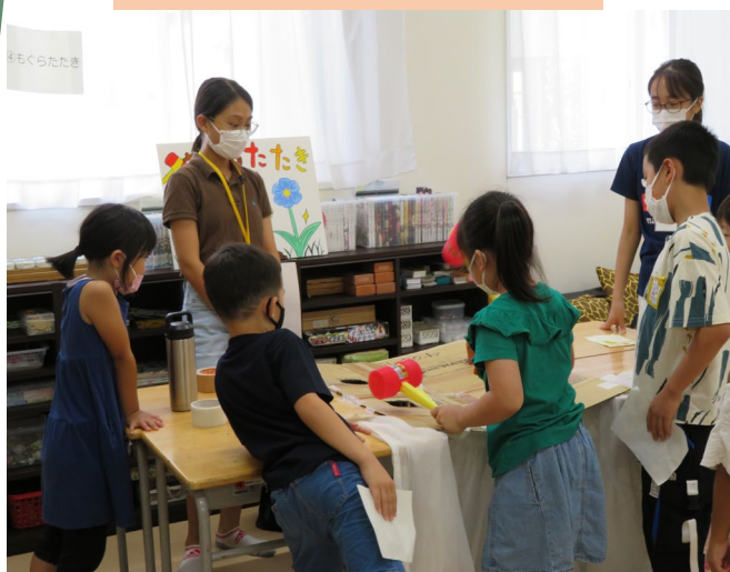
Excited with "Whack the Mole Game"