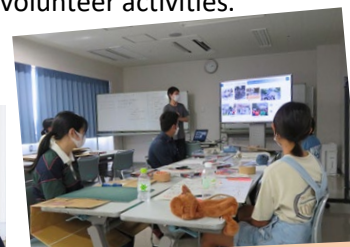
A graduate student came to talk about his experience