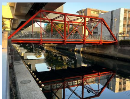
Urafune Suidobashi (Bridge) Historical bridge over Nakamura River.

The tiles are located on the road to Minami ward City Hall from Bandobashi station. Count the tiles while you walk.