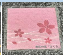
Cherry blossom drawn tiles

The tiles are located on the road to Minami ward City Hall from Bandobashi station. Count the tiles while you walk.