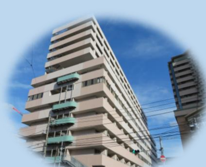
Minami Lounge is located on the 10 th floor of Urafune Fukugo Fukushi Shisetsu Building (Urafune-cho 3-46)