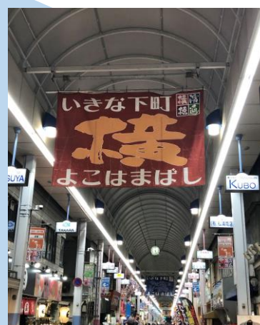
Yokohamabashidori Shopping District Many stores are here. You can buy all kinds of necessities and tasty foods!