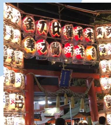
Kotohira-Otori Shrine Shrine near Yokohamabashidori shopping district. Many people visit here on the Tori-no-ichi event day.