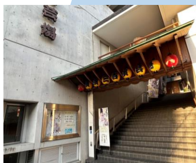
Miyoshi Engeijo You can see Taishu Engeki (Japanese style amazing performance) here!