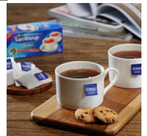
Sweets & Tea from Indonesia