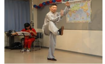
Know the world class