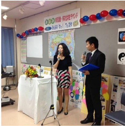
MCs of the festival