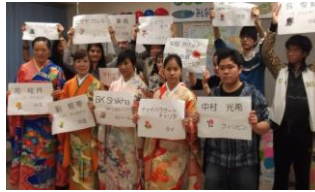
Japanese speech contest