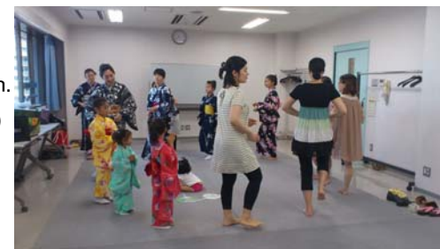
Photograph:1st meeting/ Dance

TEL: 232-9544 (Foreign Languages available)